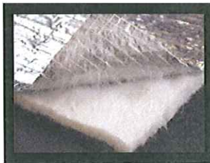
Glass Reinforced Foil Backing